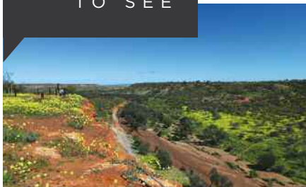
COALSEAM NATIONAL PARK

Arguably the most spectacular wildflower site in Western Australia and Mingenew is right on its doorstep!